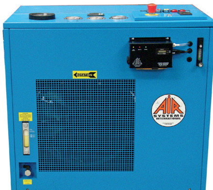
Horizontal Fill Compressor