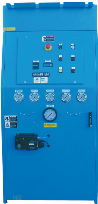
Vertical Fill Compressor