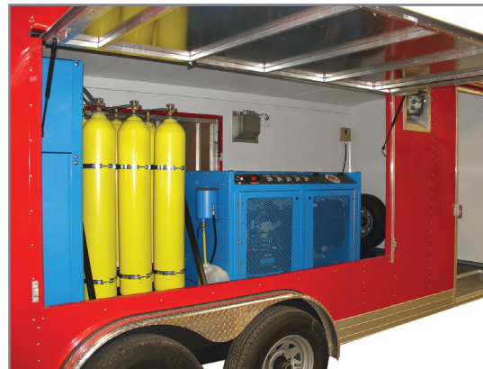
Mobile Fill Trailer

Electric, Gasoline, or Diesel Models Available